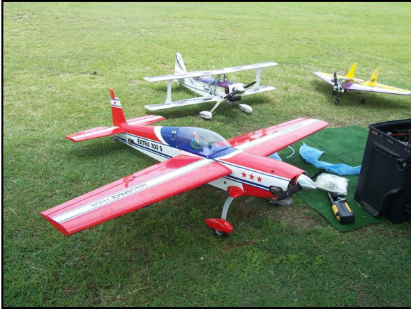
Above: Leigh Curtis' Extra 300.