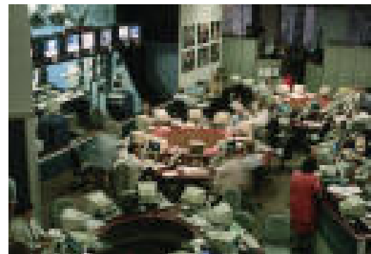
The news room????

The need for an editor for Propwash has arisen, so if you are interested in putting the Clubs information and activities together and keeping the other members informed then please let us know. This can be a temporary position till September or if really interested till whenever