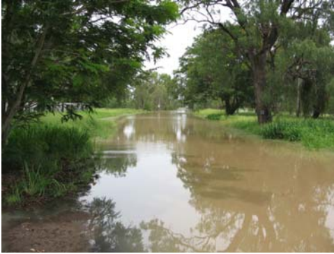
Normal access across the Bridge