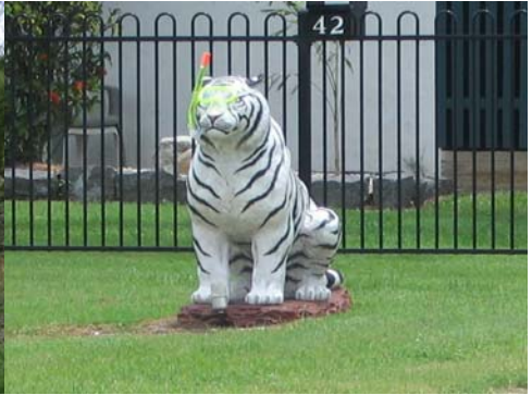
Even the local wildlife was prepared