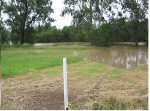
And the Woolwash