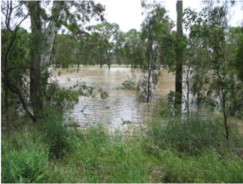
From our back fence across the creek