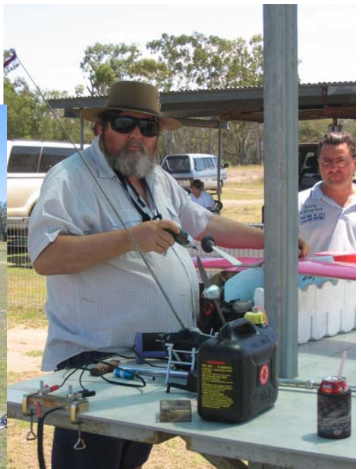
The Cook about to operate??