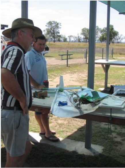
The sad demise of yet another Model