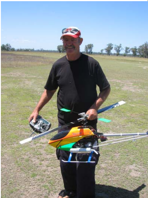
It must have been good, the smile doesn't get bigger