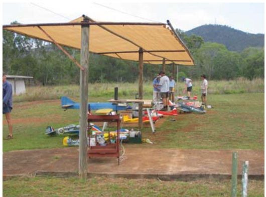
The pits area at Gladstone.

On the 23 rd September some nine RMAC members (and a few partners) arrived at the Gladstone "Ticor" flying field bringing with them a variety of models, from electrics and glow powered aircraft to helicopters. In all the day and company was quite enjoyable. The wind direction was a little unpredictable and gave a few members minor problems. The BBQ and drinks were well accepted by all there.