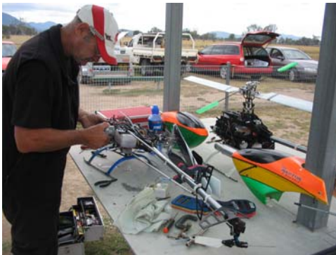
Mike's Field repair shop