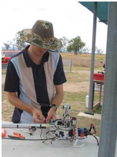
Phil's Diagnostics bench