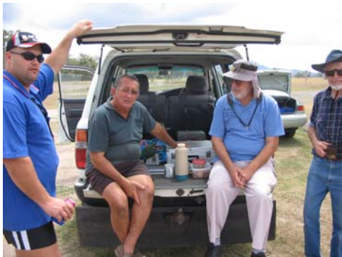
Laurie's Smoko Lounge (well patronised)