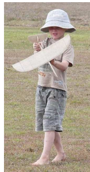
Great to see the little ones giving it a go