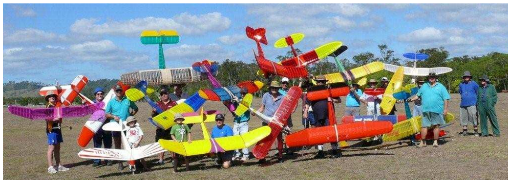
A beautiful display of Old Timers

Hopefully all will be well for Sarina in July of 2009, the accompanying photos should show the good time had by all. Note the croquet match at night. Nick Welburn.