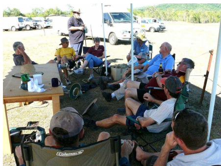
Catching up for a chat with friends